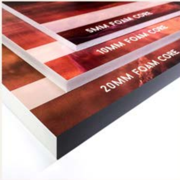
FOAM CORE - 5 m m / 1 0 m m / 2 0 m m

Wire Hangers Available $5.00 Can use velcro as an alternative