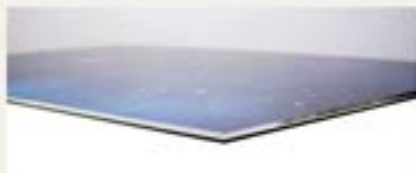
3 m m