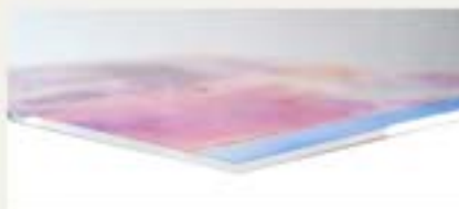
6 m m