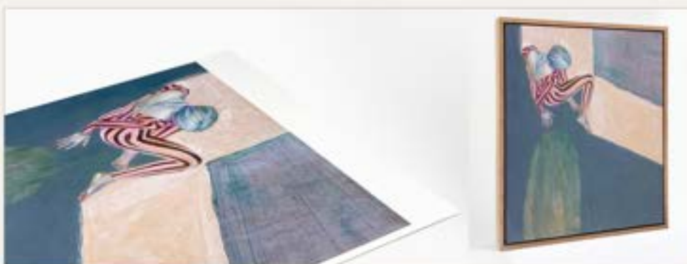
LIMITED EDITION PRINT