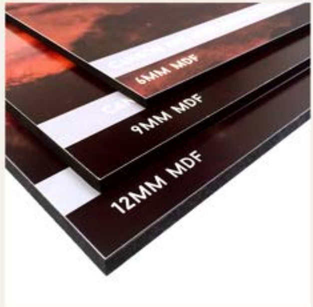
MDF - 6 m m / 9 m m / 1 2 m m

Wire Hangers Available $5.00 Can use velcro as an alternative