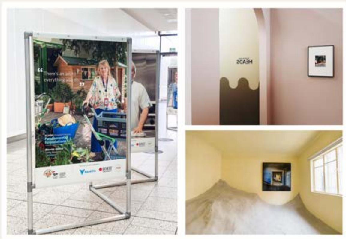
Royal Melb hospital 150 year celebration exhibition

Please arrange an appointment to discuss opportunities for your next project.